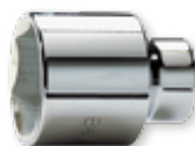
BUSSOLA / Socket